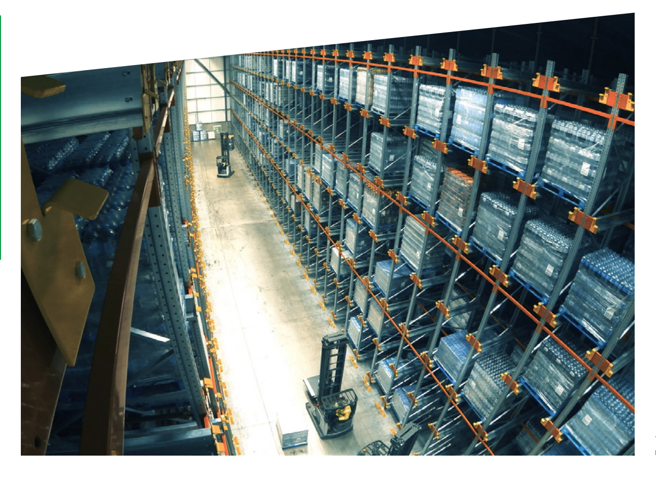
11.6m high shuttle rack system.