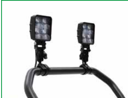
LED working lights to illuminate forks when driving in poor lighting conditions.