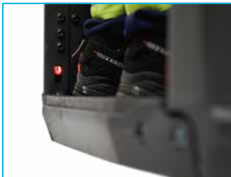
Foot protection option stops the truck automatically when the driver's feet move off the platform.