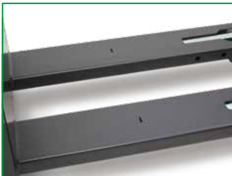
Marking on forks to ensure correct position of pallet.