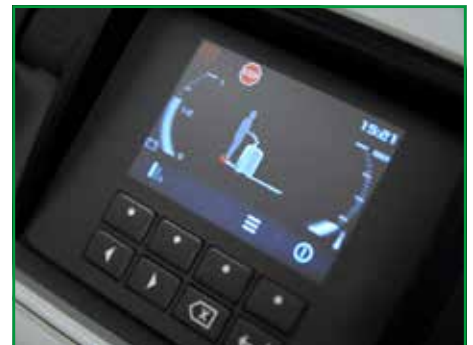
Multifunction display – advanced graphical display with keypad allows operator to interact with display.