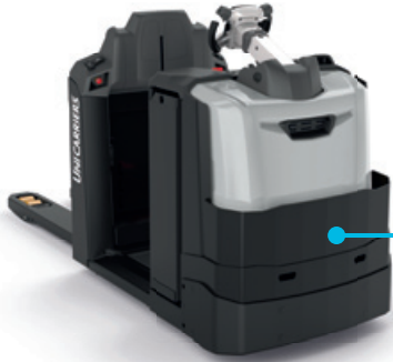
Heavy-duty bumper As strong as it gets