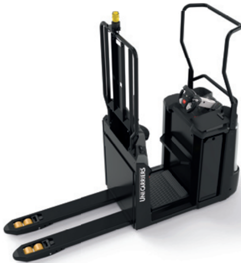
Support bars and a foldable climbing steps For safe access to higher picking locations