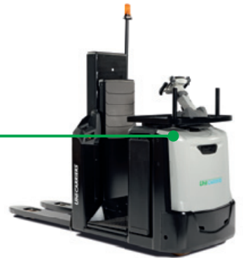
Picking tray and 1,200 mm Ergolift Add more ergonomics to your second-level picking