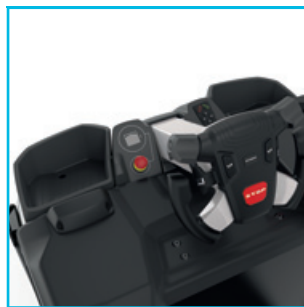
Front storage compartments and a foldable seat Make your work easier