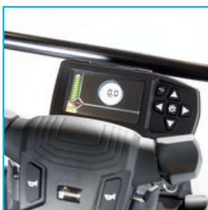
Multifunction display Easy-to-read, advanced display with all the information you need