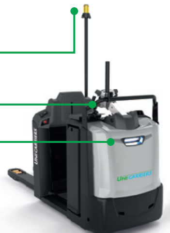
Equipment bar, blue light and warning light Many more useful options